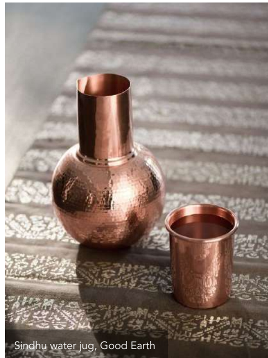
Sindhu water jug, Good Earth