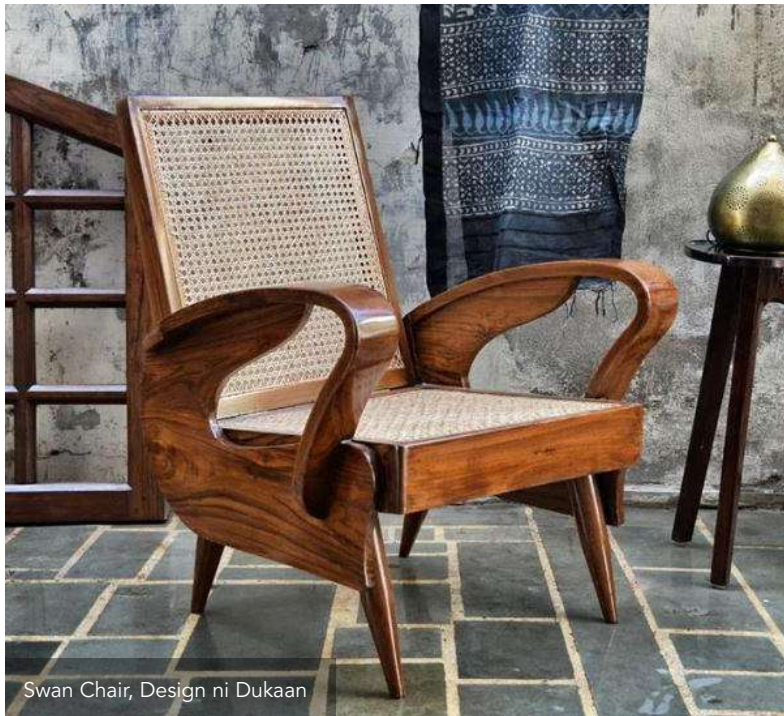
Swan Chair, Design ni Dukaan