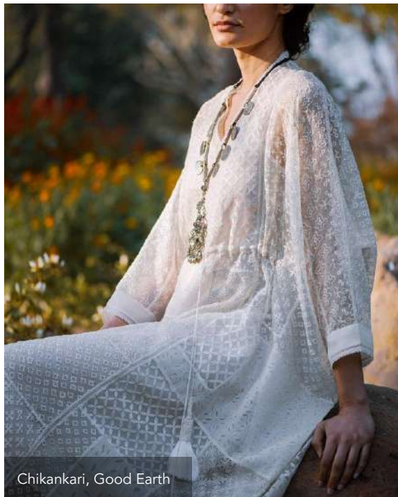
Chikankari, Good Earth