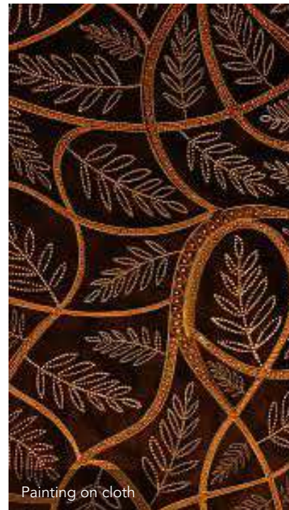
Painting on cloth