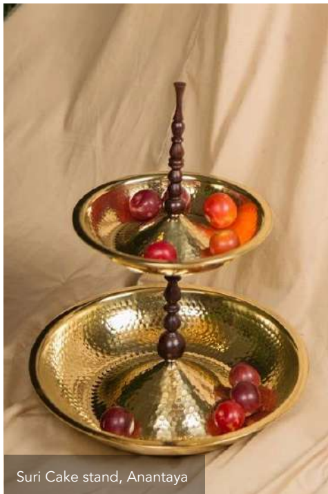
Suri Cake stand, Anantaya