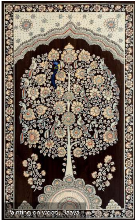
Painting on wood, Baaya