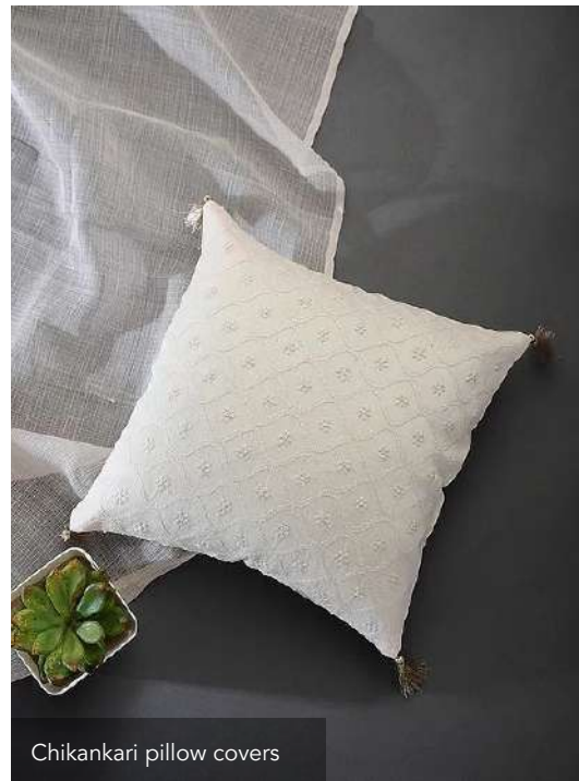
Chikankari pillow covers