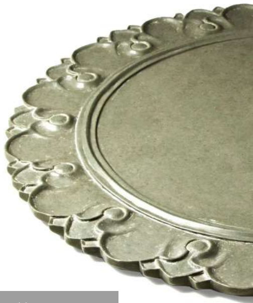
Table top, Anantaya