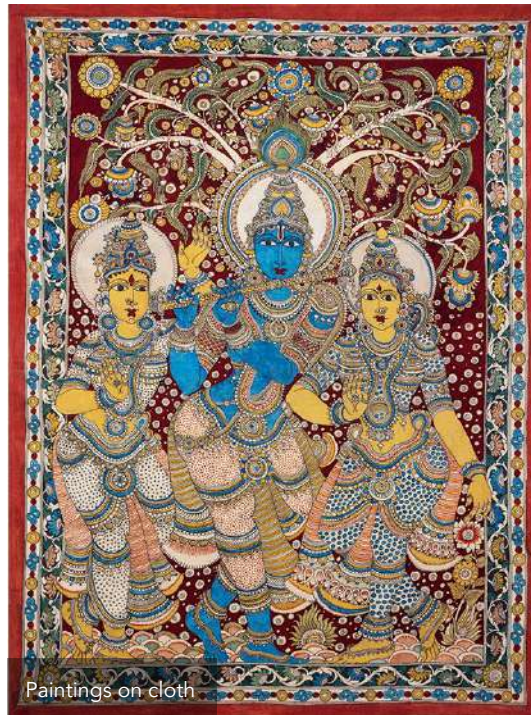
Paintings on cloth