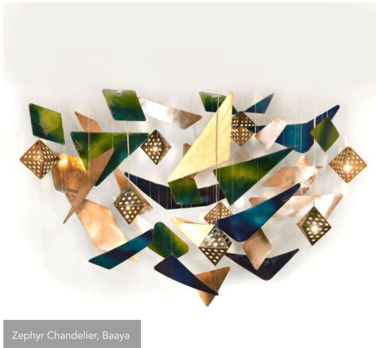
Zephyr Chandelier, Baaya