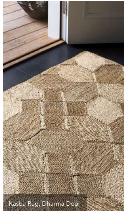
Kasba Rug, Dharma Door