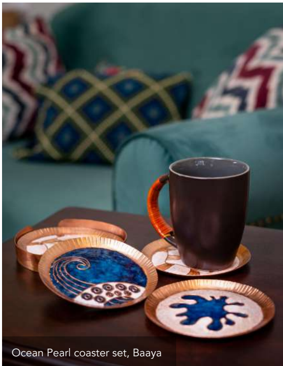
Ocean Pearl coaster set, Baaya