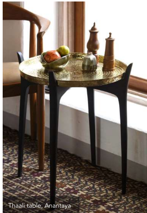
Thaali table, Anantaya