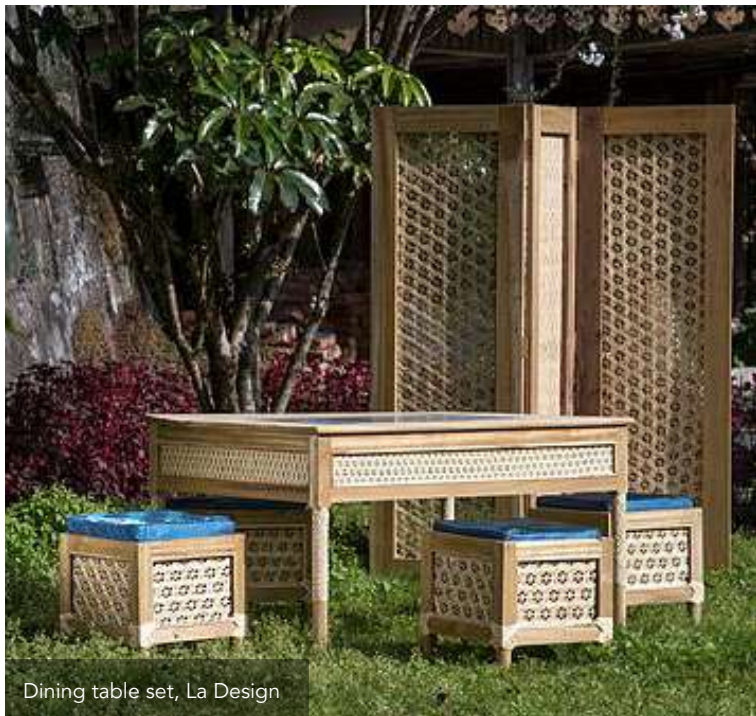
Dining table set, La Design