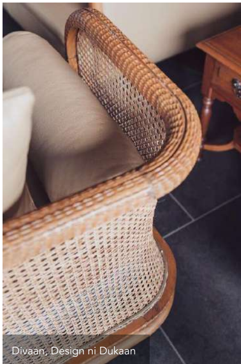
Divaan, Design ni Dukaan