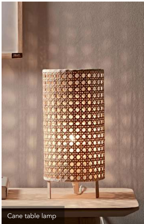
Cane table lamp