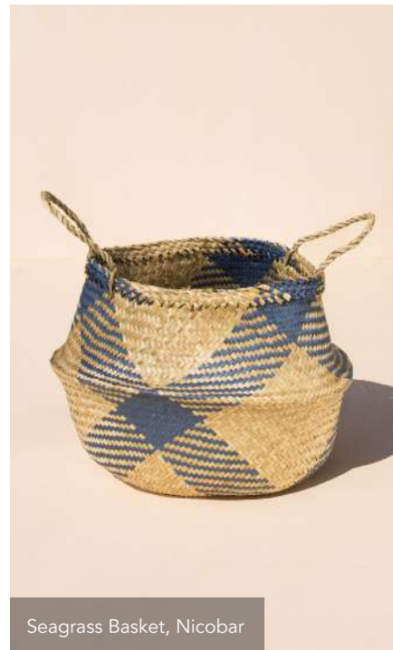
Seagrass Basket, Nicobar