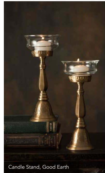
Candle Stand, Good Earth