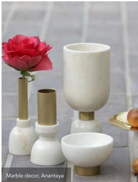
Marble decor, Anantaya