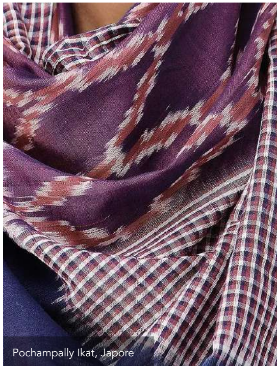
Pochampally Ikat, Japore