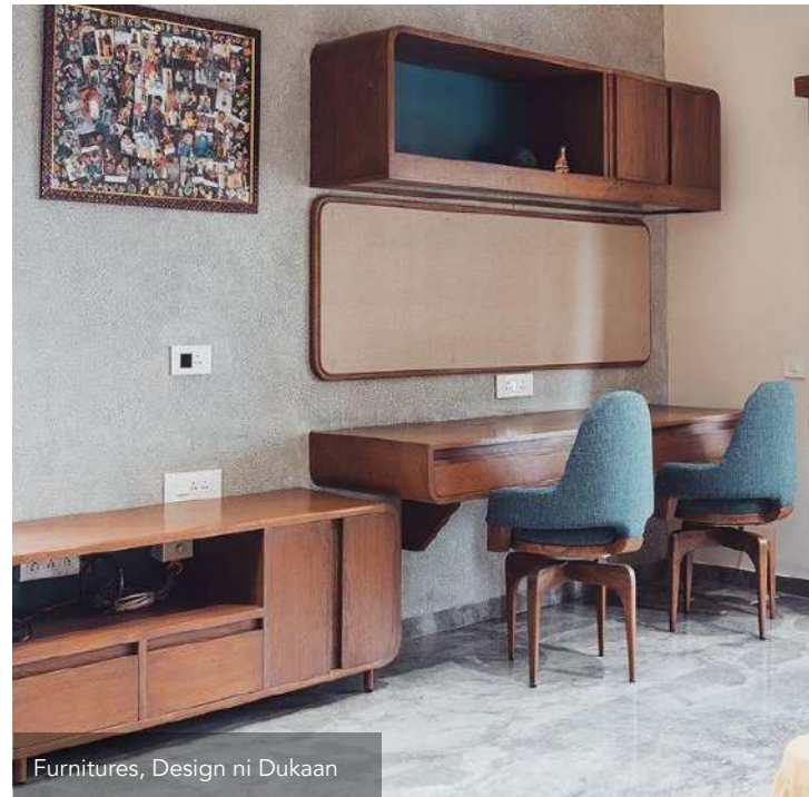
Furnitures, Design ni Dukaan